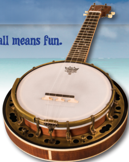
LBU-C Concert Size

Popularized in the roaring twenties and thirties, the banjolele answered the call from popular performers for greater volume. From there the unique banjolele tone solidified itself into the lexicon of ukulele music and remains instantly recognizable today.