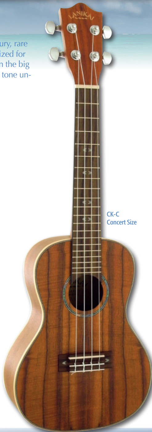
CK-C Concert Size