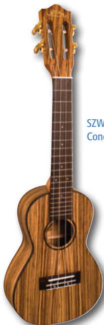
SZW-C Concert Size