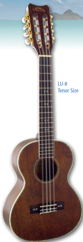
LU-8 Tenor Size