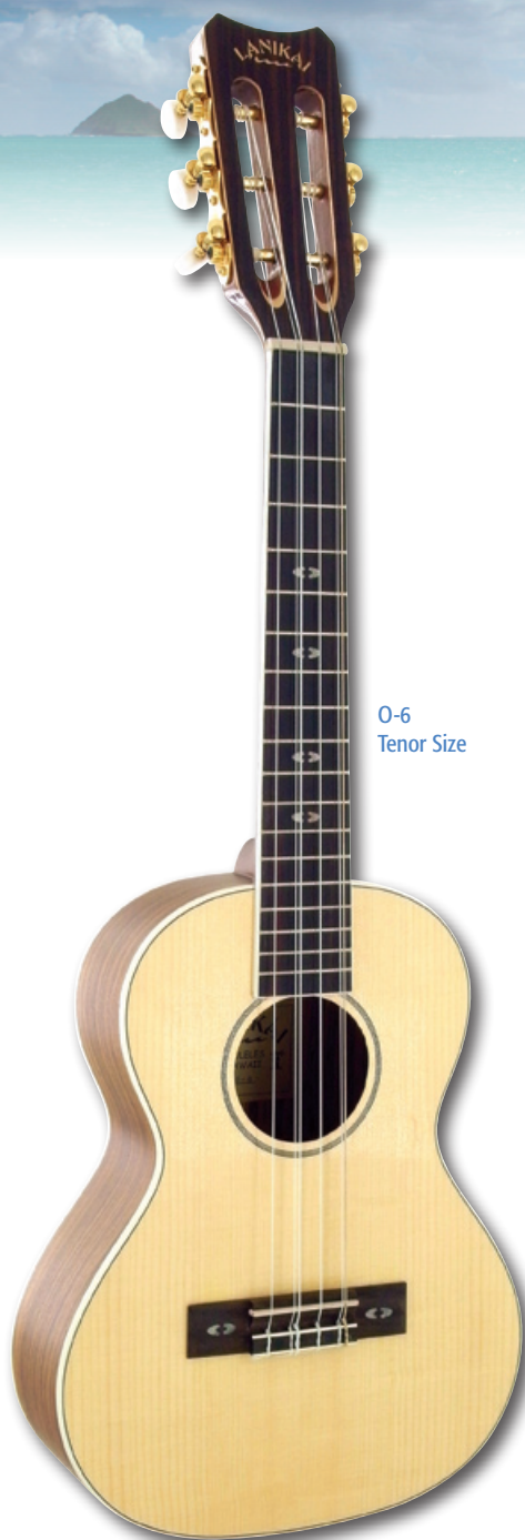
O-6 Tenor Size