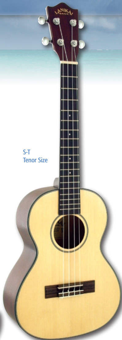
S-T Tenor Size