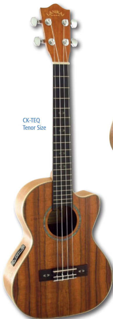
CK-TEQ Tenor Size