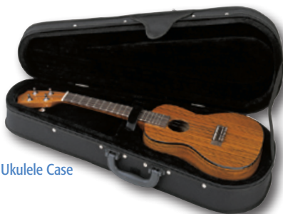
UC-C Ukulele Case