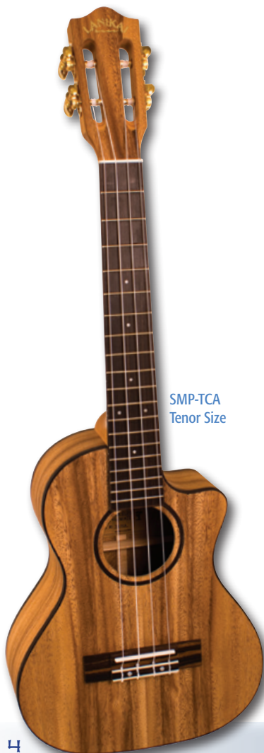
SMP-TCA Tenor Size

Lanikai has taken us to every part of the globe. Being the wood junkies that we are, we cannot resist finding new materials to experiment with. From these travels we came across Zebrawood and Monkey Pod. Each produced a fresh tone unique to the woods distinct resonance capabilities. Unadorned by synthetic enhancements, this series captures the pure essence and beauty of the natural world.