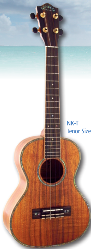
NK-T Tenor Size