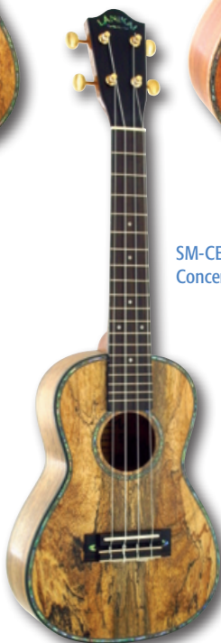
SM-CE Concert Size