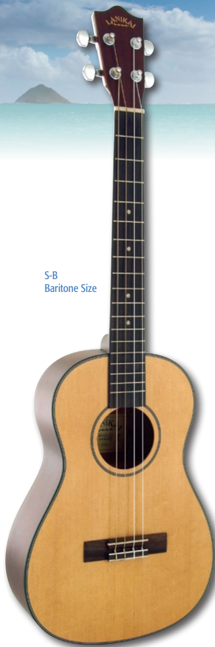
S-B Baritone Size