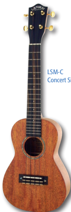
LSM-C Concert Size