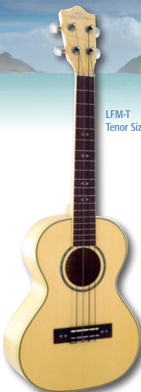
LFM-T Tenor Size