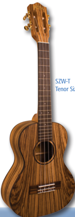
SZW-T Tenor Size