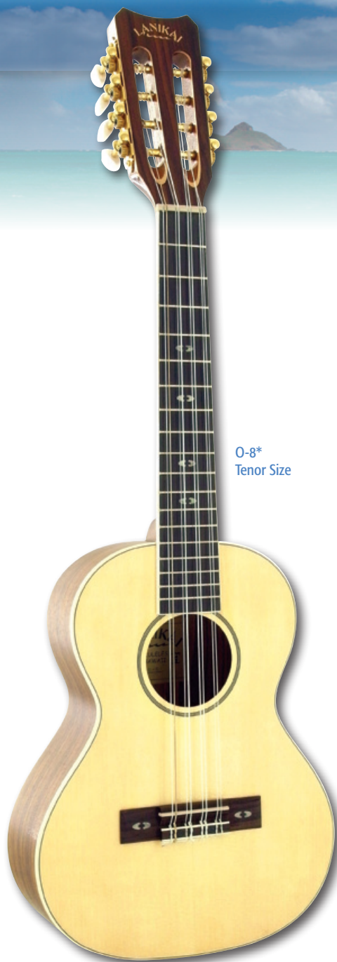
O-8* Tenor Size