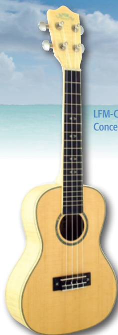
LFM-C Concert Size