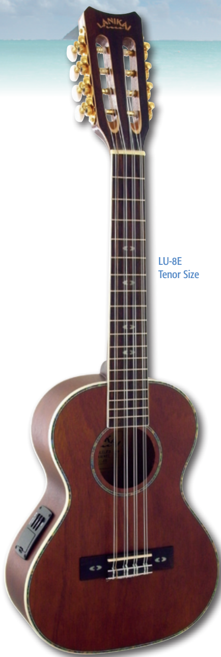
LU-8E Tenor Size