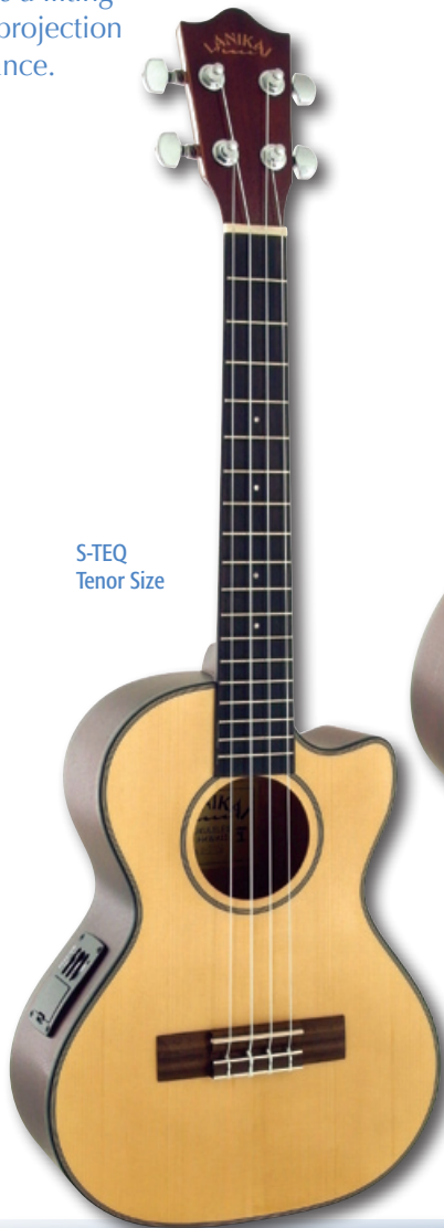
S-TEQ Tenor Size

With the classic combination of spruce and mahogany the Spruce series is perfect for those strumming singer songwriters. This wood combination gives a lilting tone with ample projection for your performance.