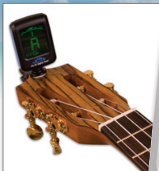
CO-UT Ukulele Tuner