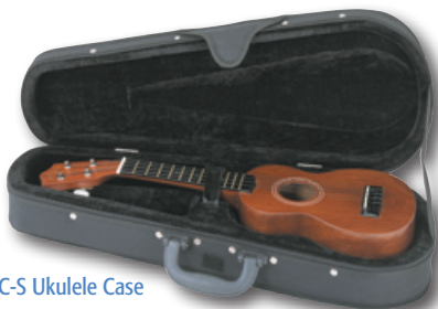
UC-S Ukulele Case