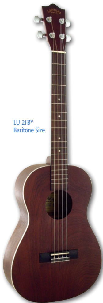
LU-21B* Baritone Size