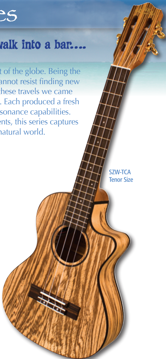
SZW-TCA Tenor Size