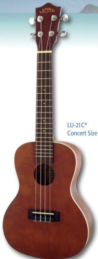
LU-21C* Concert Size