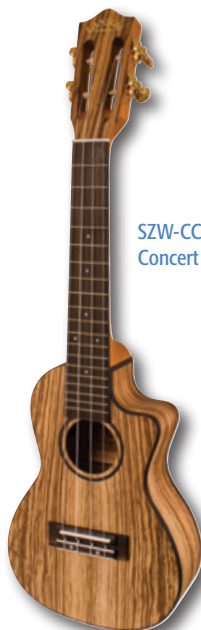
SZW-CCA Concert Size