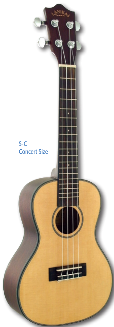
S-C Concert Size