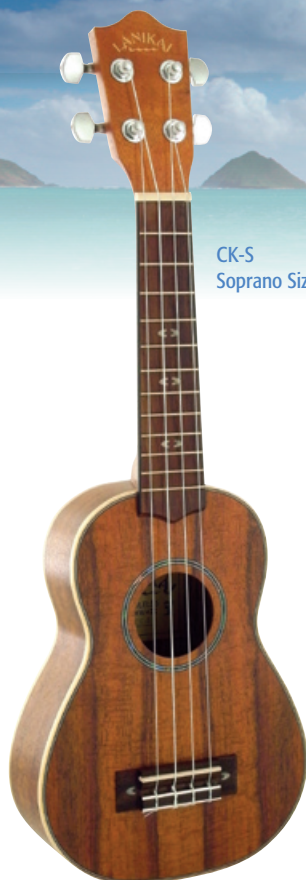
CK-S Soprano Size