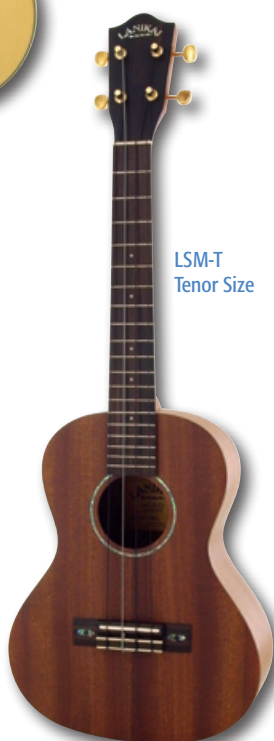
LSM-T Tenor Size