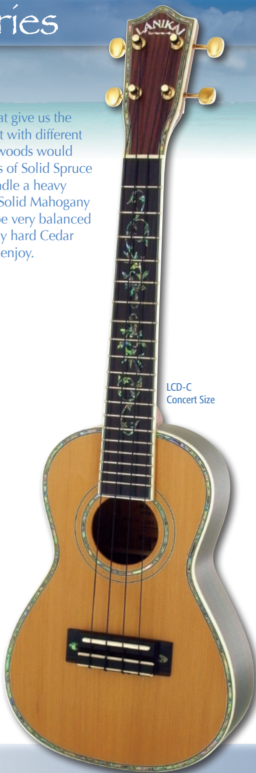
LCD-C Concert Size