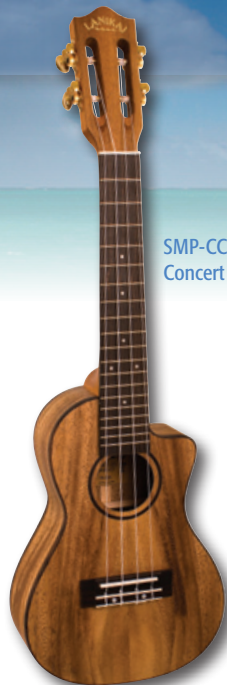
SMP-CCA Concert Size