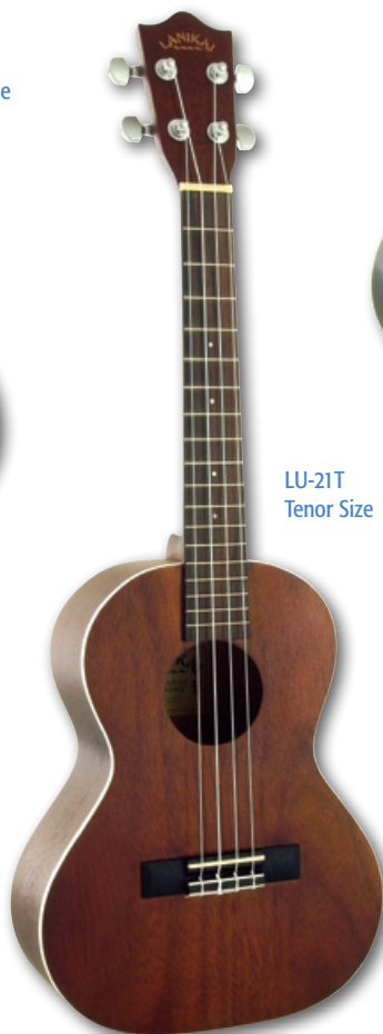
LU-21T Tenor Size