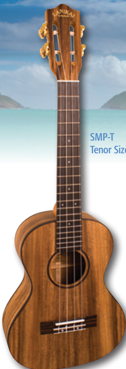
SMP-T Tenor Size