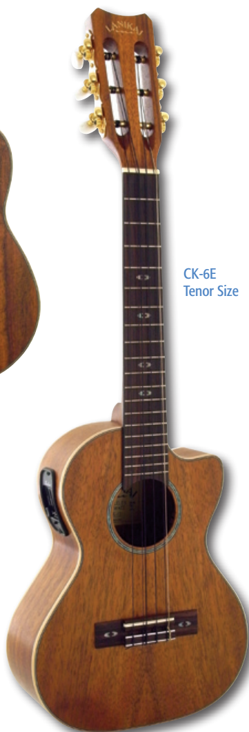
CK-6E Tenor Size