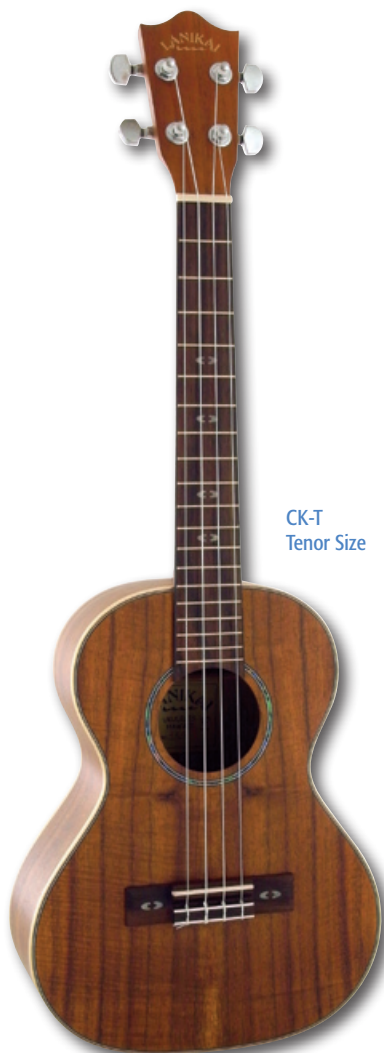
CK-T Tenor Size