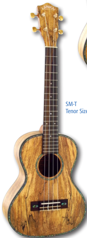
SM-T Tenor Size