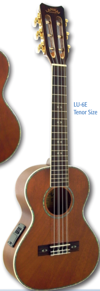
LU-6E Tenor Size