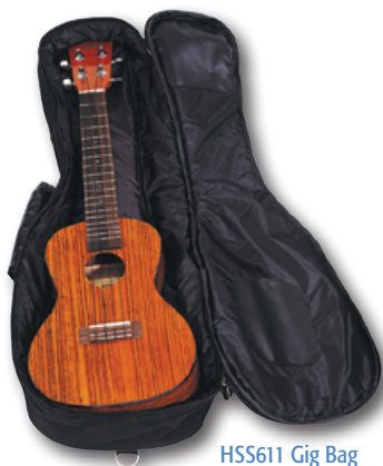
HSS611 Gig Bag