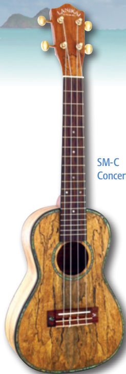
SM-C Concert Size