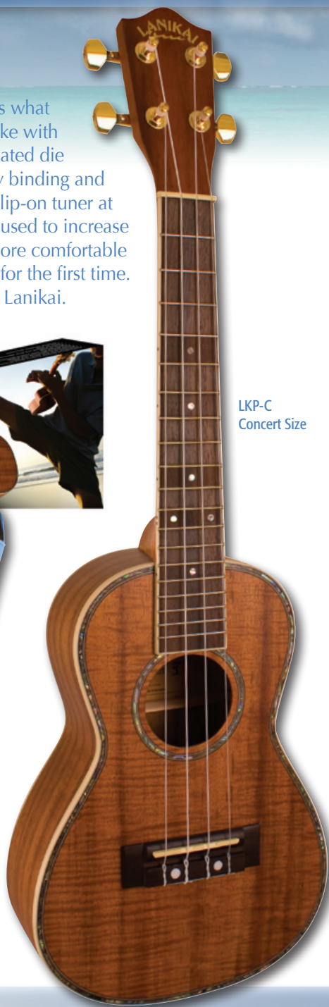
LKP-C Concert Size

The LKP-C is all about giving consumers what they asked for, a well appointed Koa uke with a rosewood fingerboard and bridge, gold plated die cast tuning machines, abalone rosette, body binding and fingerboard board inlays, a gig bag, and a clip-on tuner at a killer price. A custom wide bone nut was used to increase the string spacing, making these ukuleles more comfortable for guitarists who are trying out the ukulele for the first time. This pack represents unbeatable value from Lanikai.