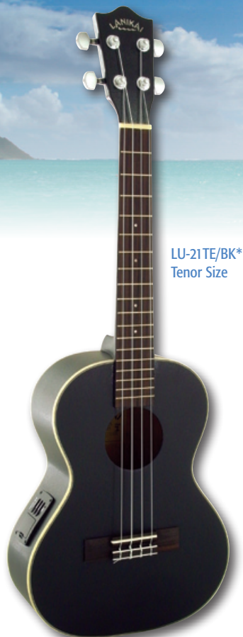
LU-21TE/BK* Tenor Size