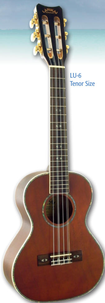
LU-6 Tenor Size