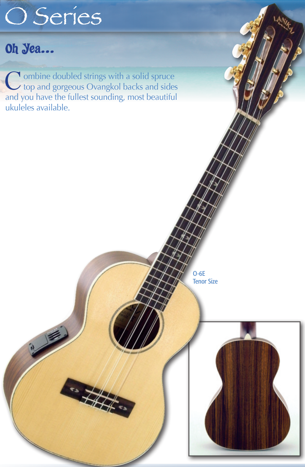
O-6E Tenor Size

Combine doubled strings with a solid spruce top and gorgeous Ovankol backs and sides and you have the fullest sounding, most beautiful ukuleles available.