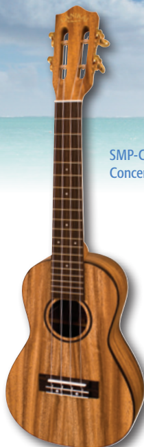
SMP-C Concert Size