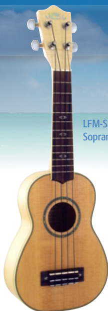
LFM-S Soprano Size